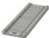
Magazine, for CMS-P1-PLOTTER, for accommodating UC1-TM..., UC1U-TM...