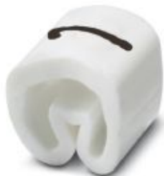
Conductor marking collar, Labeled with the number: Numbers, white, width: 3.2 mm

Please be informed that the data shown in this PDF Document is generated from our Online Catalog. Please find the complete data in the user's documentation. Our General Terms of Use for Downloads are valid ( http://phoenixcontact.com/download )