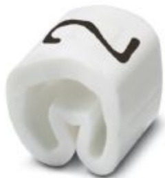
Conductor marking collar, Labeled with the number: Numbers, white, width: 3.2 mm

Please be informed that the data shown in this PDF Document is generated from our Online Catalog. Please find the complete data in the user's documentation. Our General Terms of Use for Downloads are valid ( http://phoenixcontact.com/download )