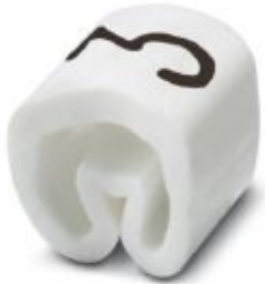
Conductor marking collar, Labeled with the number: Numbers, white, width: 3.2 mm

Please be informed that the data shown in this PDF Document is generated from our Online Catalog. Please find the complete data in the user's documentation. Our General Terms of Use for Downloads are valid ( http://phoenixcontact.com/download )