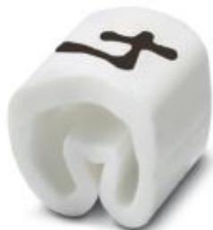
Conductor marking collar, Labeled with the number: Numbers, white, width: 3.2 mm

Please be informed that the data shown in this PDF Document is generated from our Online Catalog. Please find the complete data in the user's documentation. Our General Terms of Use for Downloads are valid ( http://phoenixcontact.com/download )