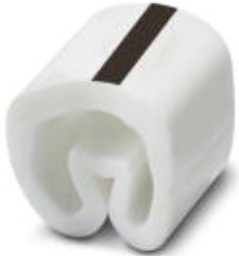
Conductor marking collar, labeled with the symbol: Symbols, white, width: 3.2 mm

Please be informed that the data shown in this PDF Document is generated from our Online Catalog. Please find the complete data in the user's documentation. Our General Terms of Use for Downloads are valid ( http://phoenixcontact.com/download )