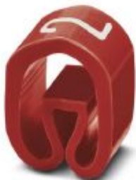
Conductor marking collar, Labeled with the number: Numbers, red, width: 4.2 mm

Please be informed that the data shown in this PDF Document is generated from our Online Catalog. Please find the complete data in the user's documentation. Our General Terms of Use for Downloads are valid ( http://phoenixcontact.com/download )