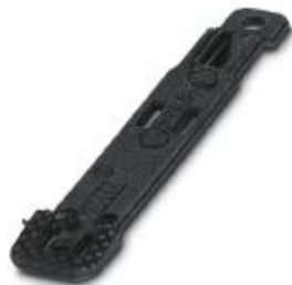
Carrier for conductor marking collar, black, unlabeled, mounting type: Assembly with cable binders, cable diameter: > 16 mm, lettering field size: 70 x 10 mm

Please be informed that the data shown in this PDF Document is generated from our Online Catalog. Please find the complete data in the user's documentation. Our General Terms of Use for Downloads are valid ( http://phoenixcontact.com/download )