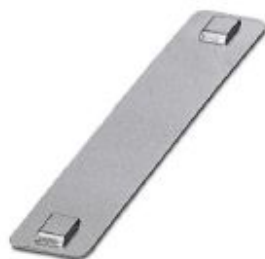
Carrier for conductor marking collar, silver, unlabeled, mounting type: Assembly with cable binders, cable diameter: > 16 mm, lettering field size: 47 x 10 mm

Please be informed that the data shown in this PDF Document is generated from our Online Catalog. Please find the complete data in the user's documentation. Our General Terms of Use for Downloads are valid ( http://phoenixcontact.com/download )