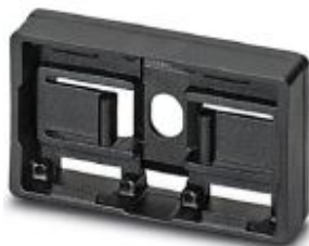
Marker carriers, black, unlabeled, mounting type: screw, rivet, lettering field size: 27 x 15 mm

Please be informed that the data shown in this PDF Document is generated from our Online Catalog. Please find the complete data in the user's documentation. Our General Terms of Use for Downloads are valid ( http://phoenixcontact.com/download )