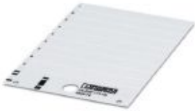
The figure shows a version of the product

Snap-in markers, Card, silver, unlabeled, can be labeled with: BLUEMARK ID COLOR, BLUEMARK ID, THERMOMARK PRIME, THERMOMARK CARD 2.0, THERMOMARK CARD, mounting type: snapped into marker carrier, lettering field size: 17 x 15 mm, Number of individual labels: 54