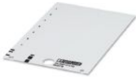
The figure shows a version of the product

Snap-in markers, Card, yellow, unlabeled, can be labeled with: BLUEMARK ID COLOR, BLUEMARK ID, THERMOMARK PRIME, THERMOMARK CARD 2.0, THERMOMARK CARD, mounting type: snapped into marker carrier, lettering field size: 27 x 8 mm, Number of individual labels: 51