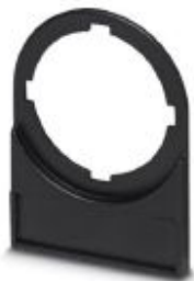
Marker carriers, black, unlabeled, mounting type: screw, rivet, diameter: 22 mm, lettering field size: 27 x 8 mm

Please be informed that the data shown in this PDF Document is generated from our Online Catalog. Please find the complete data in the user's documentation. Our General Terms of Use for Downloads are valid ( http://phoenixcontact.com/download )