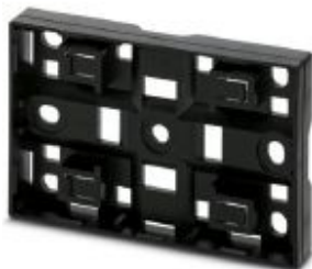
Marker carriers, black, unlabeled, mounting type: screw, rivet, lettering field size: 85.6 x 54 mm

Please be informed that the data shown in this PDF Document is generated from our Online Catalog. Please find the complete data in the user's documentation. Our General Terms of Use for Downloads are valid ( http://phoenixcontact.com/download )