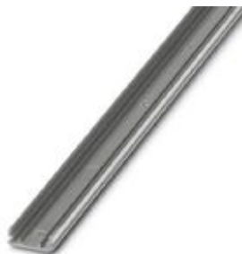
Profile, for screwing or riveting, 1000 mm long, for accommodating UC und US materials, height: 15 mm

Please be informed that the data shown in this PDF Document is generated from our Online Catalog. Please find the complete data in the user's documentation. Our General Terms of Use for Downloads are valid ( http://phoenixcontact.com/download )