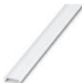
Cover, transparent, unlabeled, lettering field size: 1000 x 15 mm

Cover - CARRIER-EMP (1000X15) COVER - 0829520