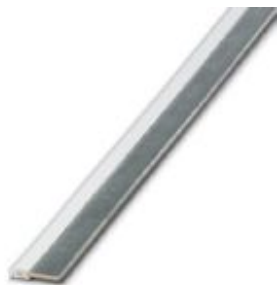
Continuous plug-in bridge, mounting type: Plug-in mounting, Color: gray

Please be informed that the data shown in this PDF Document is generated from our Online Catalog. Please find the complete data in the user's documentation. Our General Terms of Use for Downloads are valid ( http://phoenixcontact.com/download )