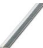
Continuous plug-in bridge, mounting type: Plug-in mounting, Color: gray

Continuous plug-in bridge - FBST 500 TMC-N GY - 0901028