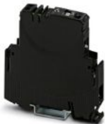
Electronic circuit breaker, signal contact: 1 N/C contact, nominal current: 3 A

Please be informed that the data shown in this PDF Document is generated from our Online Catalog. Please find the complete data in the user's documentation. Our General Terms of Use for Downloads are valid ( http://phoenixcontact.com/download )