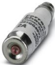
Fuse insert, nominal current: 2 A, length: 36 mm, diameter: 11 mm, color: pink

Please be informed that the data shown in this PDF Document is generated from our Online Catalog. Please find the complete data in the user's documentation. Our General Terms of Use for Downloads are valid ( http://phoenixcontact.com/download )