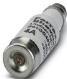
Fuse insert, nominal current: 4 A, length: 36 mm, diameter: 11 mm, color: brown

Please be informed that the data shown in this PDF Document is generated from our Online Catalog. Please find the complete data in the user's documentation. Our General Terms of Use for Downloads are valid ( http://phoenixcontact.com/download )