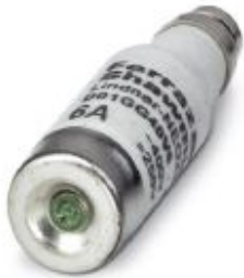
Fuse insert, nominal current: 6 A, length: 36 mm, diameter: 11 mm, color: green

Please be informed that the data shown in this PDF Document is generated from our Online Catalog. Please find the complete data in the user's documentation. Our General Terms of Use for Downloads are valid ( http://phoenixcontact.com/download )