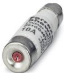
Fuse insert, nominal current: 10 A, length: 36 mm, diameter: 11 mm, color: red

Please be informed that the data shown in this PDF Document is generated from our Online Catalog. Please find the complete data in the user's documentation. Our General Terms of Use for Downloads are valid ( http://phoenixcontact.com/download )