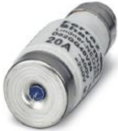
Fuse insert, nominal current: 20 A, length: 36 mm, diameter: 15 mm, color: blue

Please be informed that the data shown in this PDF Document is generated from our Online Catalog. Please find the complete data in the user's documentation. Our General Terms of Use for Downloads are valid ( http://phoenixcontact.com/download )