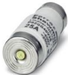
Fuse insert, nominal current: 25 A, length: 36 mm, diameter: 15 mm, color: yellow

Please be informed that the data shown in this PDF Document is generated from our Online Catalog. Please find the complete data in the user's documentation. Our General Terms of Use for Downloads are valid ( http://phoenixcontact.com/download )