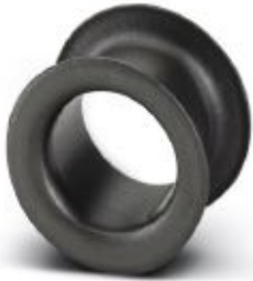
Adapter sleeve, nominal current: 16 A, color: gray

Please be informed that the data shown in this PDF Document is generated from our Online Catalog. Please find the complete data in the user's documentation. Our General Terms of Use for Downloads are valid ( http://phoenixcontact.com/download )