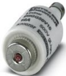
Fuse insert, nominal current: 10 A, length: 50 mm, diameter: 22 mm, color: red

Please be informed that the data shown in this PDF Document is generated from our Online Catalog. Please find the complete data in the user's documentation. Our General Terms of Use for Downloads are valid ( http://phoenixcontact.com/download )