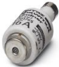
Fuse insert, nominal current: 16 A, length: 50 mm, diameter: 22 mm, color: gray

Please be informed that the data shown in this PDF Document is generated from our Online Catalog. Please find the complete data in the user's documentation. Our General Terms of Use for Downloads are valid ( http://phoenixcontact.com/download )