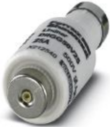
Fuse insert, nominal current: 25 A, length: 50 mm, diameter: 22 mm, color: yellow

Please be informed that the data shown in this PDF Document is generated from our Online Catalog. Please find the complete data in the user's documentation. Our General Terms of Use for Downloads are valid ( http://phoenixcontact.com/download )