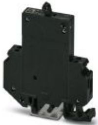
Thermomagnetic circuit breaker, 1-pos., fast blow, 1 N/C contact, with universal foot for mounting on NS 32 or NS 35

Please be informed that the data shown in this PDF Document is generated from our Online Catalog. Please find the complete data in the user's documentation. Our General Terms of Use for Downloads are valid ( http://phoenixcontact.com/download )