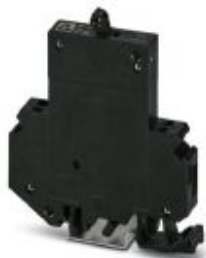
Thermomagnetic circuit breaker, 1-pos., normal blow, 1 N/O contact, with universal foot for mounting on NS 32 or NS 35

Please be informed that the data shown in this PDF Document is generated from our Online Catalog. Please find the complete data in the user's documentation. Our General Terms of Use for Downloads are valid ( http://phoenixcontact.com/download )