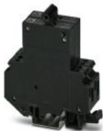
Thermomagnetic circuit breaker, 2-pos., fast blow, 1 N/O contact and 1 N/C contact, with universal foot for mounting on NS 32 or NS 35

Please be informed that the data shown in this PDF Document is generated from our Online Catalog. Please find the complete data in the user's documentation. Our General Terms of Use for Downloads are valid ( http://phoenixcontact.com/download )