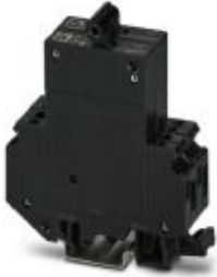
Thermomagnetic circuit breaker, 2-pos., normal blow, 1 N/O contact and 1 N/C contact, with universal foot for mounting on NS 32 or NS 35

Please be informed that the data shown in this PDF Document is generated from our Online Catalog. Please find the complete data in the user's documentation. Our General Terms of Use for Downloads are valid ( http://phoenixcontact.com/download )