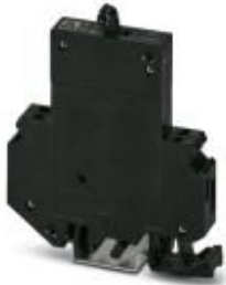
Thermomagnetic circuit breaker, 1-pos., normal blow, 1 N/O contact, with universal foot for mounting on NS 32 or NS 35

Please be informed that the data shown in this PDF Document is generated from our Online Catalog. Please find the complete data in the user's documentation. Our General Terms of Use for Downloads are valid ( http://phoenixcontact.com/download )