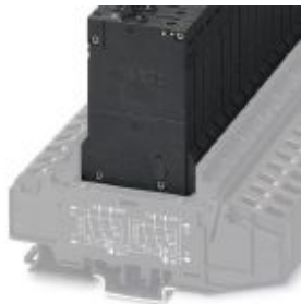
Thermomagnetic circuit breaker, 1-pos., fast blow, 1 N/O contact and 1 N/C contact

Please be informed that the data shown in this PDF Document is generated from our Online Catalog. Please find the complete data in the user's documentation. Our General Terms of Use for Downloads are valid ( http://phoenixcontact.com/download )