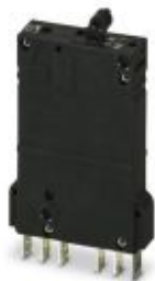
Thermomagnetic circuit breaker, 1-pos., normal blow, 1 N/O contact and 1 N/C contact

Please be informed that the data shown in this PDF Document is generated from our Online Catalog. Please find the complete data in the user's documentation. Our General Terms of Use for Downloads are valid ( http://phoenixcontact.com/download )