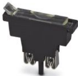
Fuse plug, nominal current: 6.3 A, length: 45.4 mm, width: 9.9 mm, color: black

Please be informed that the data shown in this PDF Document is generated from our Online Catalog. Please find the complete data in the user's documentation. Our General Terms of Use for Downloads are valid ( http://phoenixcontact.com/download )