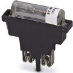
Fuse plug, nominal current: 6.3 A, length: 45.4 mm, width: 9.9 mm, color: black

Please be informed that the data shown in this PDF Document is generated from our Online Catalog. Please find the complete data in the user's documentation. Our General Terms of Use for Downloads are valid ( http://phoenixcontact.com/download )