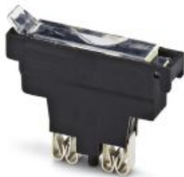
Fuse plug, nominal current: 10 A, length: 45.4 mm, width: 9.9 mm, color: black

Please be informed that the data shown in this PDF Document is generated from our Online Catalog. Please find the complete data in the user's documentation. Our General Terms of Use for Downloads are valid ( http://phoenixcontact.com/download )