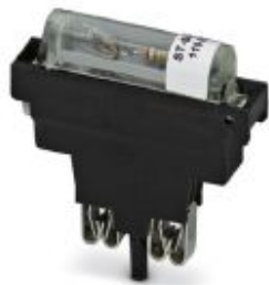
Fuse plug, nominal current: 10 A, length: 45.4 mm, width: 9.9 mm, color: black

Please be informed that the data shown in this PDF Document is generated from our Online Catalog. Please find the complete data in the user's documentation. Our General Terms of Use for Downloads are valid ( http://phoenixcontact.com/download )