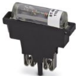
Fuse plug, nominal current: 6.3 A, length: 45.4 mm, width: 9.9 mm, color: black

Please be informed that the data shown in this PDF Document is generated from our Online Catalog. Please find the complete data in the user's documentation. Our General Terms of Use for Downloads are valid ( http://phoenixcontact.com/download )