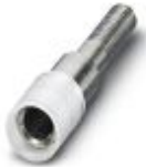
Female test connector, color: transparent

Female test connector - PSBJ 4/15/6 FARBLOS - 0303419