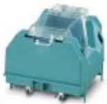
Infeed magazine for accommodating a max. of 20 UniCard sheets