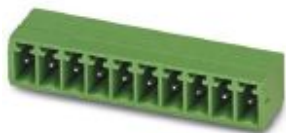
The figure shows the 10-pos. standard item

PCB headers, nominal current: 8 A, rated voltage (III/2): 160 V, nominal cross section: 1.5 mm 2 , number of positions: 8, pitch: 3.81 mm, color: green, contact surface: Tin, mounting: Wave soldering, pin layout: Linear pinning, solder pin [P]: 3.4 mm