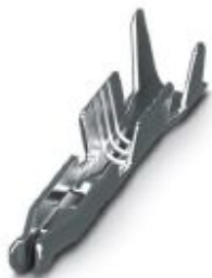
Crimp contact, type of contact: Female connector, connection method: Crimp connection, contact surface: Tin

Please be informed that the data shown in this PDF Document is generated from our Online Catalog. Please find the complete data in the user's documentation. Our General Terms of Use for Downloads are valid ( http://phoenixcontact.com/download )