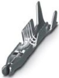
Crimp contact, type of contact: Female connector, connection method: Crimp connection, contact surface: Tin

Please be informed that the data shown in this PDF Document is generated from our Online Catalog. Please find the complete data in the user's documentation. Our General Terms of Use for Downloads are valid ( http://phoenixcontact.com/download )