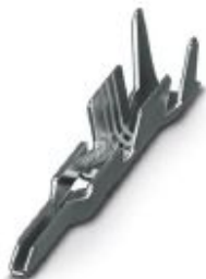
Crimp contact, type of contact: Male connector, connection method: Crimp connection, contact surface: Tin

Please be informed that the data shown in this PDF Document is generated from our Online Catalog. Please find the complete data in the user's documentation. Our General Terms of Use for Downloads are valid ( http://phoenixcontact.com/download )