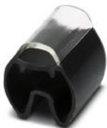
Conductor marker carrier, transparent/black, unlabeled, mounting type: slide-on, cable diameter range: 4 ... 7 mm, lettering field size: 10 x 4 mm

Please be informed that the data shown in this PDF Document is generated from our Online Catalog. Please find the complete data in the user's documentation. Our General Terms of Use for Downloads are valid ( http://phoenixcontact.com/download )