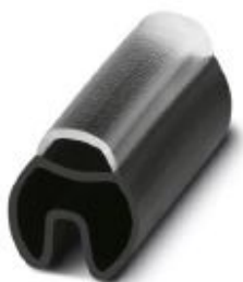
Conductor marker carrier, transparent/black, unlabeled, mounting type: slide-on, cable diameter range: 4 ... 7 mm, lettering field size: 15 x 4 mm

Please be informed that the data shown in this PDF Document is generated from our Online Catalog. Please find the complete data in the user's documentation. Our General Terms of Use for Downloads are valid ( http://phoenixcontact.com/download )