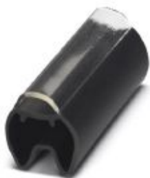
Conductor marker carrier, transparent/black, unlabeled, mounting type: slide-on, cable diameter range: 4 ... 7 mm, lettering field size: 23 x 4 mm

Please be informed that the data shown in this PDF Document is generated from our Online Catalog. Please find the complete data in the user's documentation. Our General Terms of Use for Downloads are valid ( http://phoenixcontact.com/download )