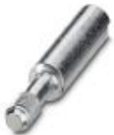
Coding peg for coding up to 16 connectors