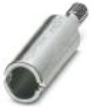
Coding socket for coding up to 16 connectors